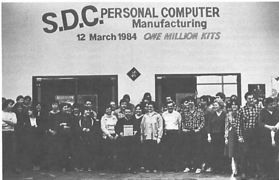
A proud flock of employees at the Software Distribution Center in Northboro stands under the sign symbolizing their accomplishment: one million Digital Classified Software kits.

Teamed up with the SDC personnel are the automated assembly lines, called "carousels," which turn out software kits at the rate of eight to 12 per minute. The SDC currently has two lines in operation,