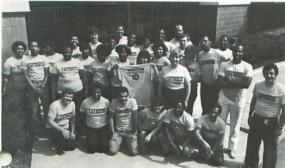
To generate excitement their pacesetting United Way campaign, the Boston plant offered "limited edition" tee-shirts for sale during pledge week. They received 237 orders for 200 tee-shirts.

The Supplementary Contribution for the December payment period will be $63.75 and begin on July 5, the seventh week of the new payment period. More than 23,000 employees purchased over 340,000 shares of common stock.