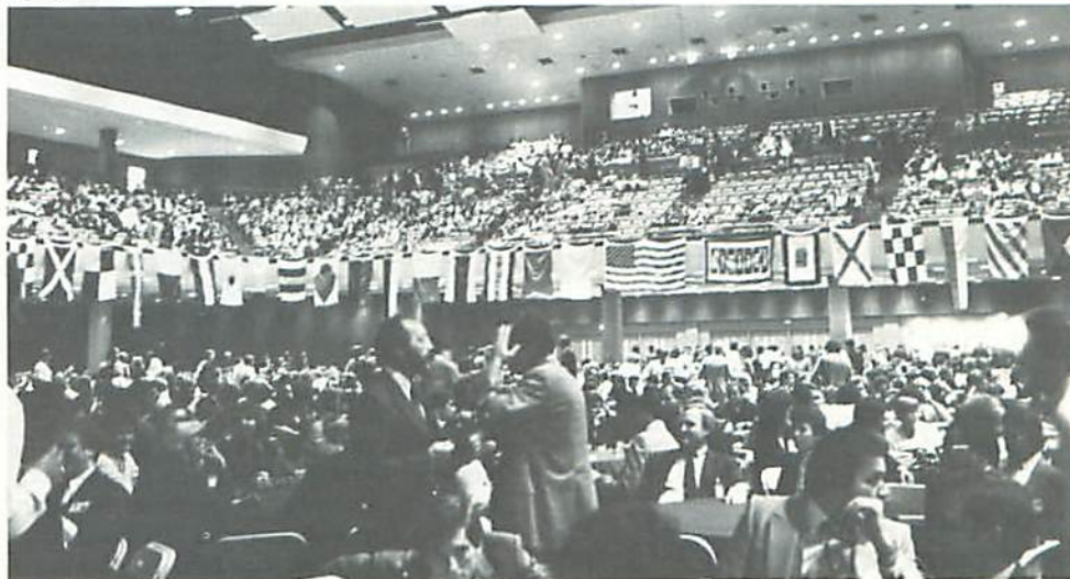
The sheer size of the sales force is evident as the first meeting convenes.