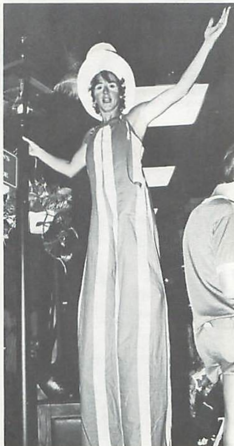
Street entertainment keeps the urban mood alive at DECTown.