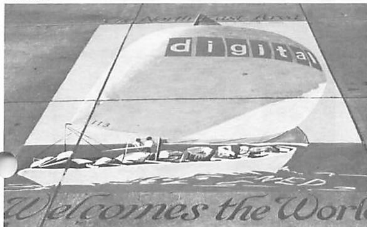
A chalk etching by Sidewalk Sam in front of the Hynes welcomes the sales force.