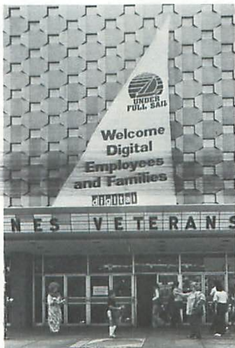
The excitement continued all day at the Hynes Auditorium during DECTown Family Day.