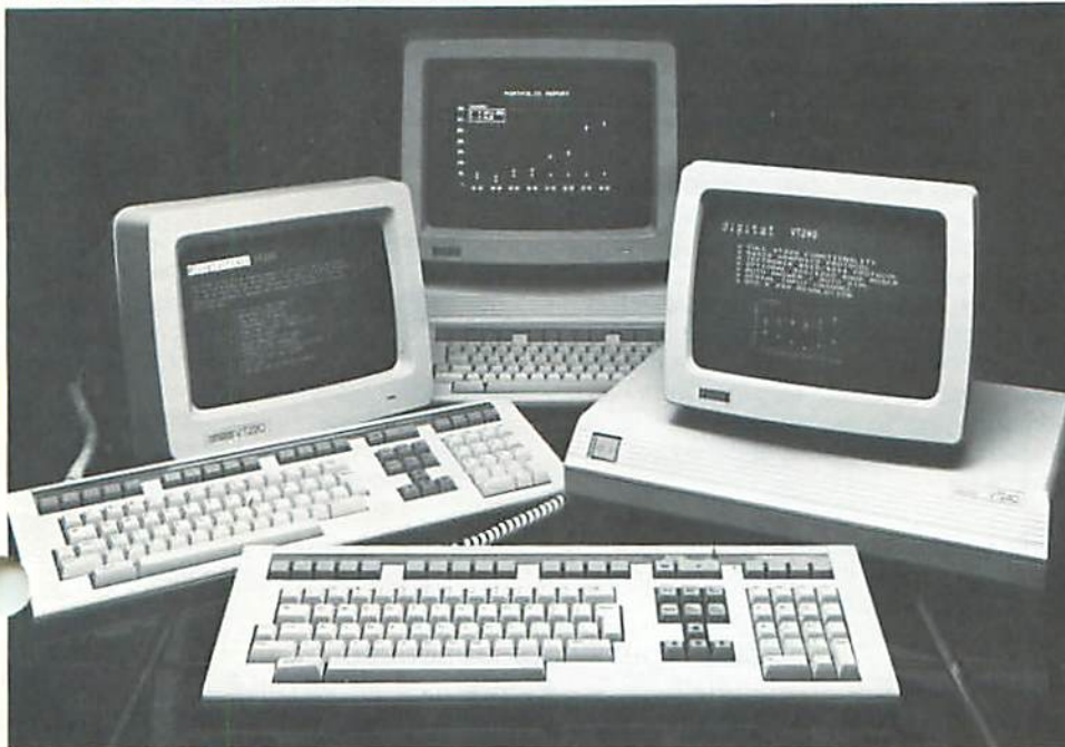
The VT200 family, Digital's newest video terminals

The right product, in the right place, at the right time is the marketing philosophy which allowed Digital to define the industry standard when the VT100 video terminal family was introduced five years ago. But in the dynamic computer industry, even standards must evolve.