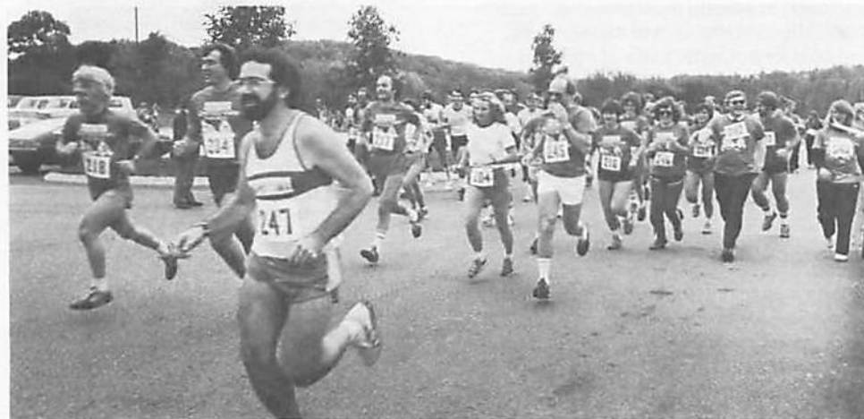
Close to 80 employees participated in the Fun Run and Heart Beat Aerobics for United Way collecting more than 1500 pledges.