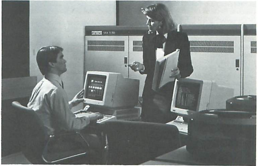
The new VAX-11/785, Digital's most powerful single VAX computer ever, delivers 50 to 70 percent greater performance than the standard-setting VAX-11/780 system.