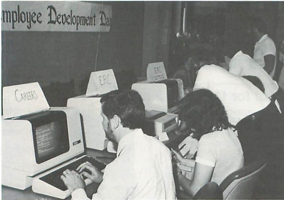
Employees using the on-line job search system during the Marlboro Cluster Employee Development Day.

More than 300 employees attended the Employee Development Day sponsored recently by the Cluster Management and Employee Development Organization, in conjunction with Marlboro Manufacturing, Large Systems Integration group and the Computer Special Systems Engineering group.