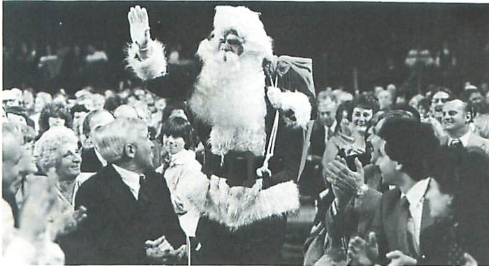
In his traditional visit, Santa Claus will greet the audience at the Christmas at Pops performance.