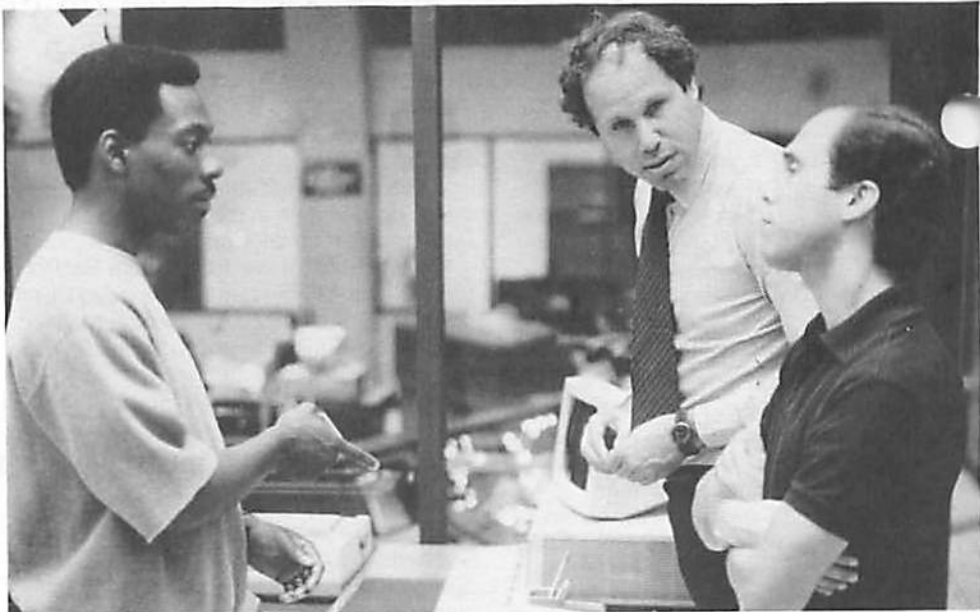
"Beverly Hills Cop" starring Eddie Murphy and a Rainbow personal computer.

A Rainbow is also being used in the new film, "Starman," starring Jeff Bridges and Karen Allen. ■