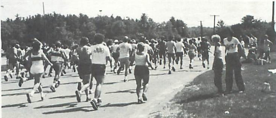
Digital Tewksbury facility recently hosted its first 10K road race. Some 115 runners ran the 6.21 mile course through Tewksbury and Andover.