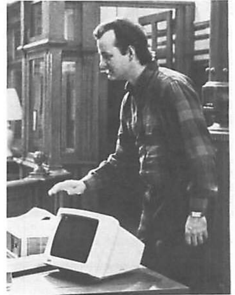
In a scene from "Ghost Busters," actor-comedian Bill Murray pats the video monitor of a Digital Rainbow personal computer.

PBS is producing a series called "The Computer Thing," to air during the upcoming