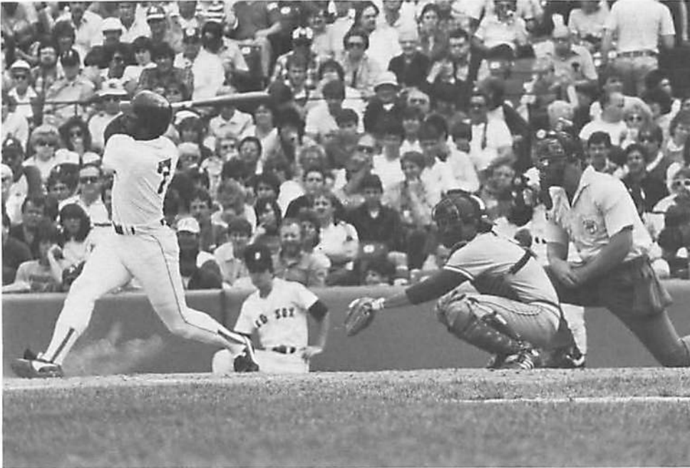
Five-thousand Digital employees and their families watched Red Sox designated hitter Mike Easler smack one during Boston's 5-3 win over Toronto on June 24, which was "DECday at Fenway."

Various Greater Boston non-profit organizations participated in DECday by special invitation. Among the groups receiving tickets from Digital were Alianza, Boston Indian Council, Boys Club of Roxbury, Boston YMCA, Big Brothers and Big Sisters of Worcester, and the Nazarene Home for Boys in Worcester.