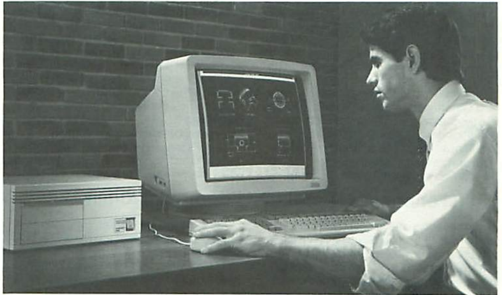
Digital's new VAXstation 2000 features high-performance graphics and networking capabilities. The system screen displays two-dimensional, mechanical computer-aided design (CAD) drafting from the Geodraw package from Structural Dynamics Research Corp.

The new products are targeted at problem solving in commercial, engineering, manufacturing, government, scientific and education markets — or any area where the productivity of individuals, work groups, departments and organizations is improved by cost-effective, distributed computing.