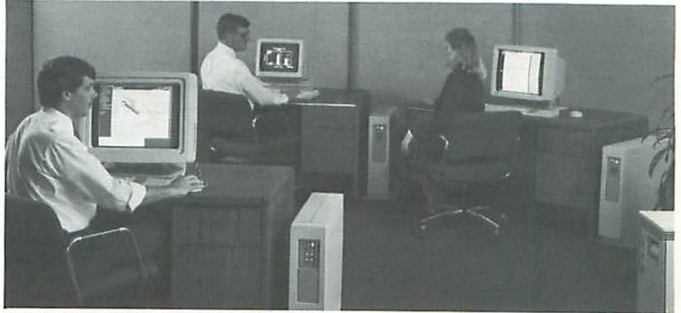
Local Area VAXcluster Systems — Digital's solution for work group and departmental computing.

One system manager can perform the management functions for all the clients of the Local Area VAXcluster system, thus