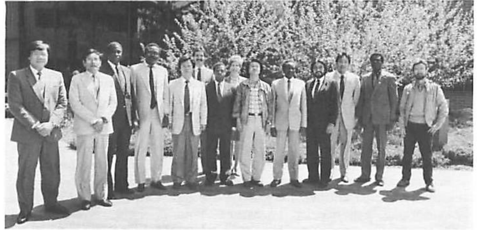
The Telecommunications Industry Marketing Group recently hosted a dozen representatives from developing nations for the annual United States Telecommunications Training Institute. A non-profit organization based in Washington, D.C., the institute trains people who operate broadcast and telephone systems throughout the Third World. Digital, along with other industry leaders, sponsors classes on all aspects of the telecommunications industry.