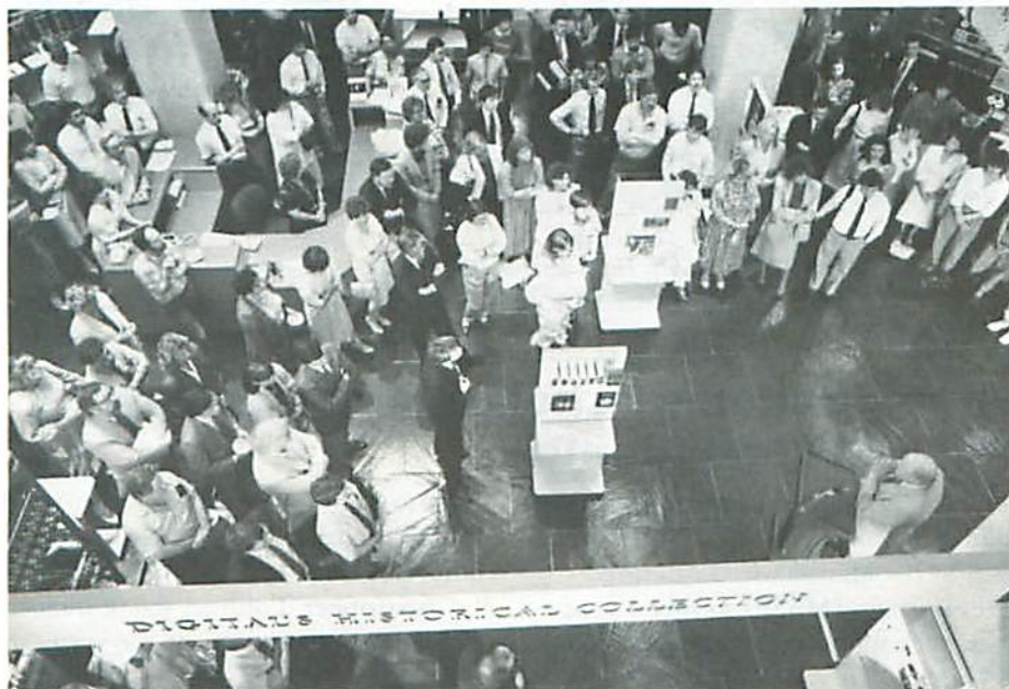
Digital's Central Collection Exhibit recently opened in Marlboro. In the photo at right, President Ken Olsen delivers some welcoming remarks surrounded by items from Digital's past, and (below) by interested employees.