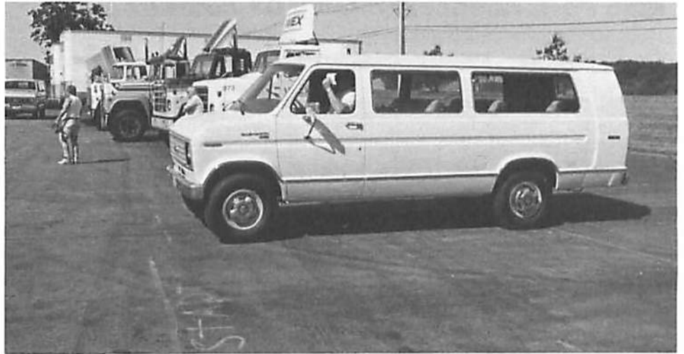
Van drivers get ready to move off the line.