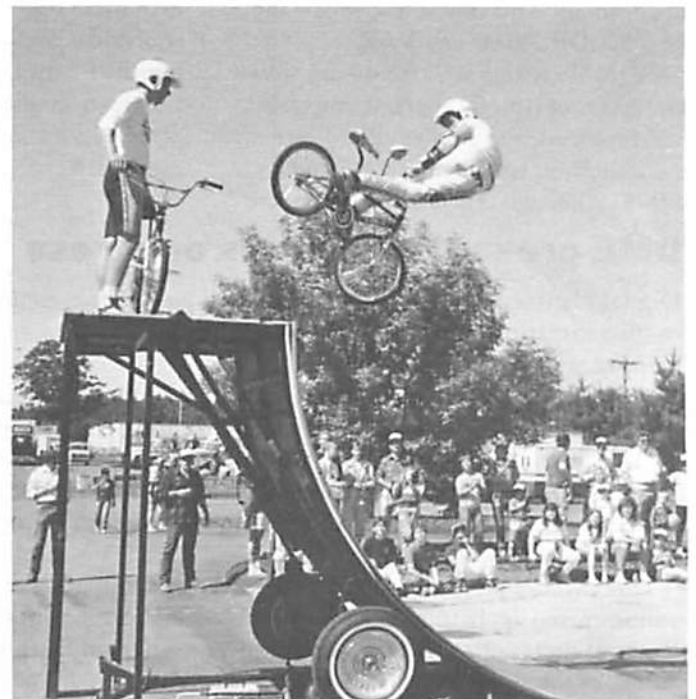
A BMX stunt cyclist flies up and off the ramp.