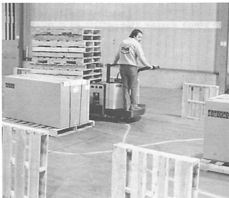
It takes skill and patience to maneuver a fork truck around the pallets in the warehouse.