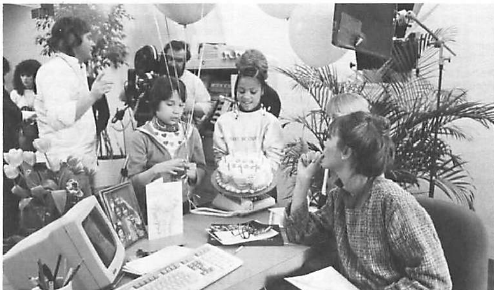
Digital's Rainbow 100 is featured in a 30-second public service announcement emphasizing non-traditional Girl Scout leaders.

The target of the campaign is not only men, but any non-traditional role model, including couples, single women, college students, the elderly and professionals. "Mothers are still encouraged to lead troops, but, says Colette Phillips, public relations director for Patriot's Trail, "we want to change the predisposed point of view that mothers are the only ones who can lead a troop." For the phone number of your local Girl Scout organization contact the Patriot's Trail (617) 482-1078.