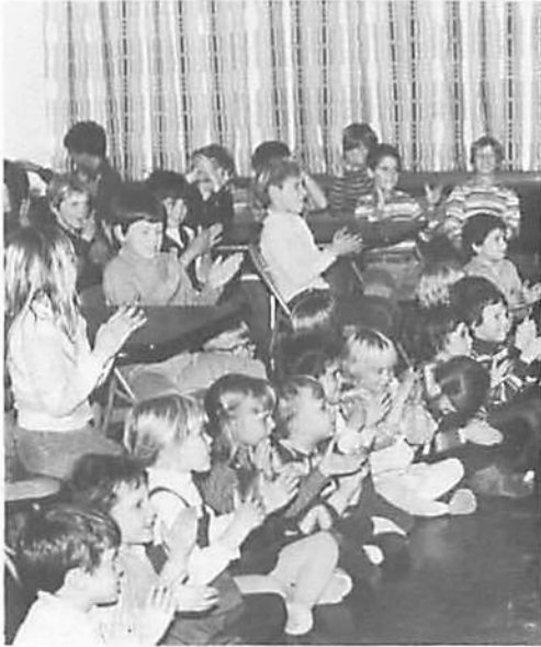
Children from St. Bridget's applaud the DEC carolers for their outstanding performance at the school.