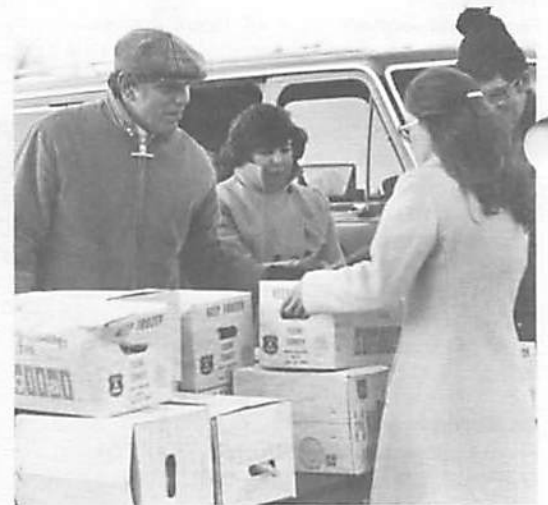
Other employees gave their time to distribute turkeys in December.