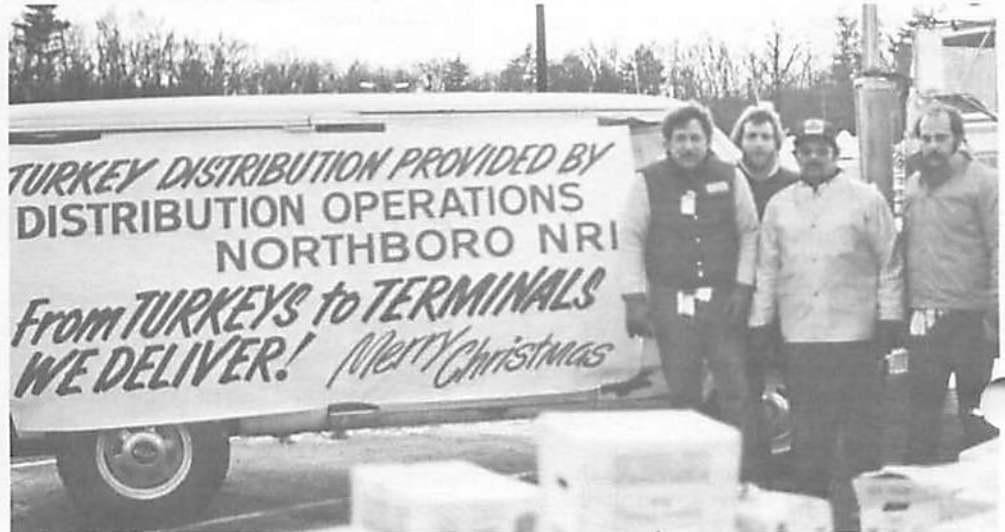
Distribution Operations from Northboro speak for themselves.