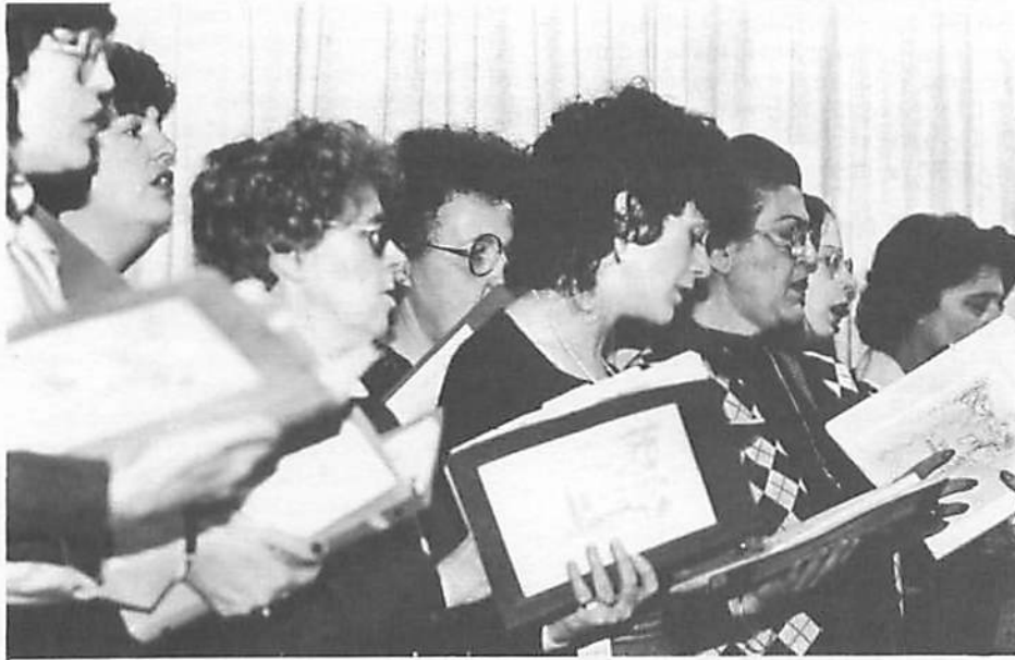
All Digital employees, the carolers gave up their lunch break to serenade area facilities.