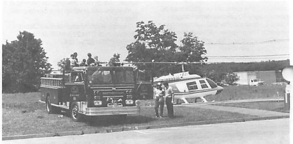
A Northboro town fire engine, Digital helicopter, antique trucks and midget race cars were side attractions to the day's events.