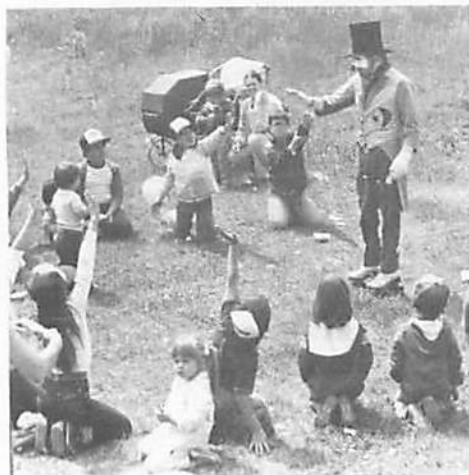
Clowns, ponies, balloons, games and prizes were just a few special features for the kids.