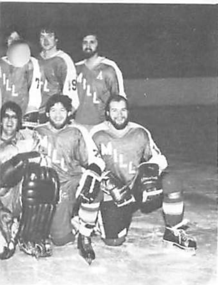
the Mill Northstars.