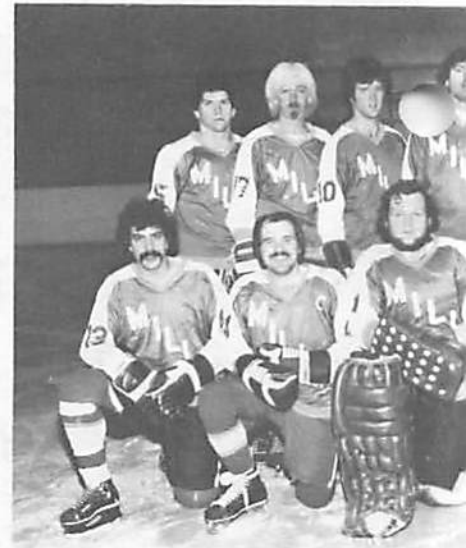
The winners of the Digital Hockey League playoffs.

The Digital Hockey League finished their season with Parker Street Hawks in first place with 19 wins, 2 losses and 1 tie, 10 points over the second place Mill Northstars and Marlboro Manufacturing teams.