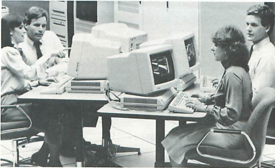
The VAX 8600, Digital's newly introduced computing system, brings an unprecedented level of power, economy and flexibility to large, complex computer aided design and computer aided manufacturing (CAD/CAM) environments.