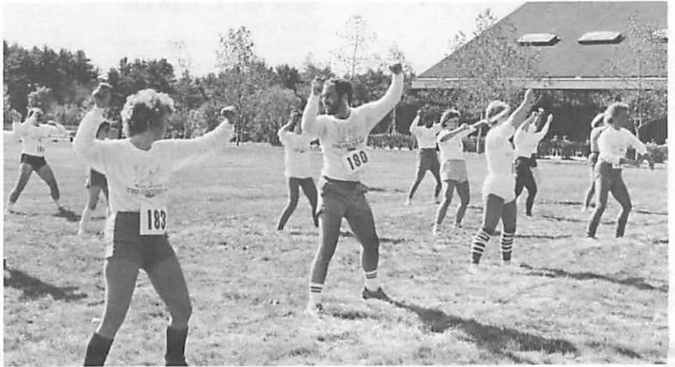
Stow employees came out in full force to participate in the Heartbeat Aerobics.