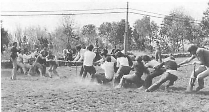
Four events were held during the week of October 15-19 at Virginia Road, including a grueling tug-of-war (above), pie eating, Simon Says and a fun run around one of the VRO buildings. Through these activities, Virginia Road employees have raised $260 for the United Way.