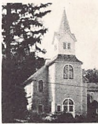
Mission Evangelical Congregational Church Maynard, Massachusetts