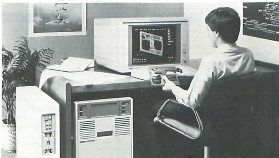
The VAXstation 500 workstation is the first color-monitor member of its VAXstation family of high-resolution graphics workstations.