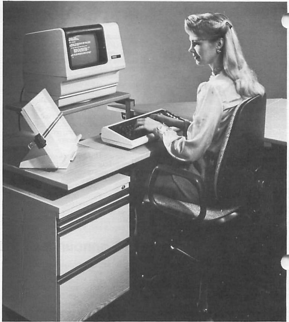
Digital's new office furniture is ergonomically designed for user comfort.

New ergonomic modular office furniture designed for use with VT100-family video terminals and complementary hardcopy terminal stands were introduced by the Accessories and Supplies Group. The modular furniture includes a split-top adjustable table, fixed-height work tables, a mobile diskette file, and a free-standing copyholder. It was designed by ergonomic specialists for ease of use and space efficiency.