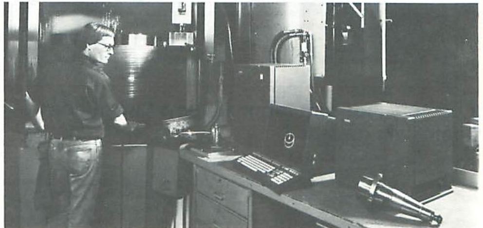
Digital's new factory systems products bring computing power to industrial environments.

Three new computer systems comprise the basic industrial family: the Industrial VAX