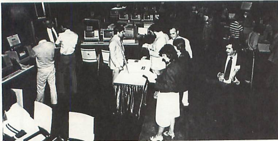
More than 2,400 employees turned out to see Internal DECUS's demonstration area which showcased products.

More than 2,400 employees, representing Digital's largest customer base attended Internal DECUS's Spring Symposium at the Sheraton Boxboro Conference Center on June 15 and 16. Featured at the symposium were over 50 sessions designed to inform internal users about the latest products, technologies, methodologies and training opportunities.